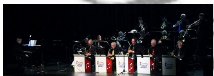
Sarasota Jazz Project