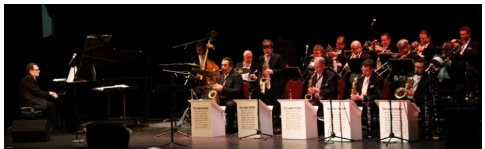
Jazz Legacy Big Band

The concert drew an estimated 375 people to the Charlotte County Cultural Center's William H. Wakeman III Theater.