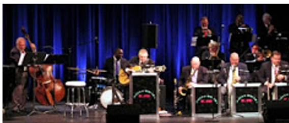
The Starlight Memories Big Band