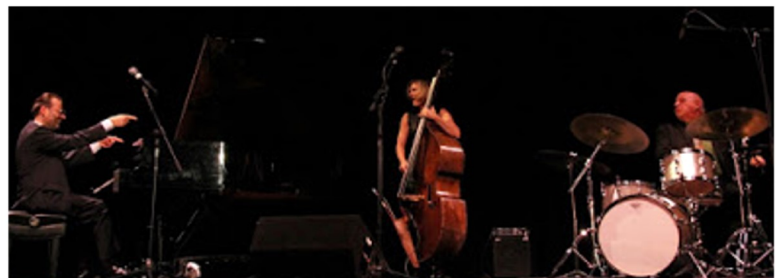
The International Trio