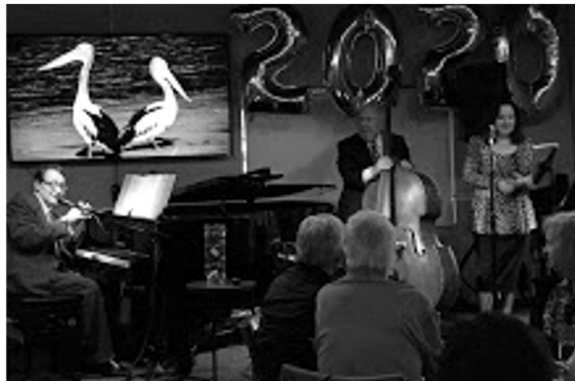
Gerson, Mopsick & Manning