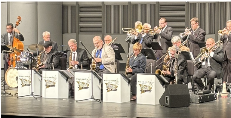
The Atomic Big Band

This smooth crooner and his band then launched into several Frank Sinatra favorites, such as “Are the Stars Out Tonight,” “Sit Down and Write Myself a Letter,” with outstanding saxophone solos, and “Fly me to the Moon.” The first half ended with a Count Basie shout out with “Luck be a Lady Tonight.”