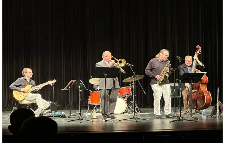
Miami Jazz Consort